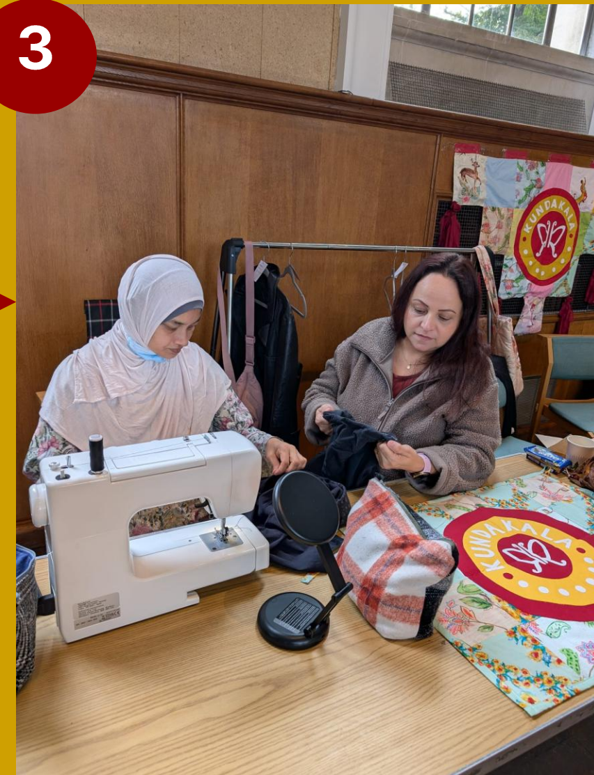
THE KUNDAKALA COLLECTIVE