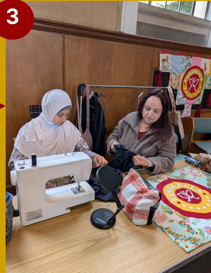
THE KUNDAKALA COLLECTIVE