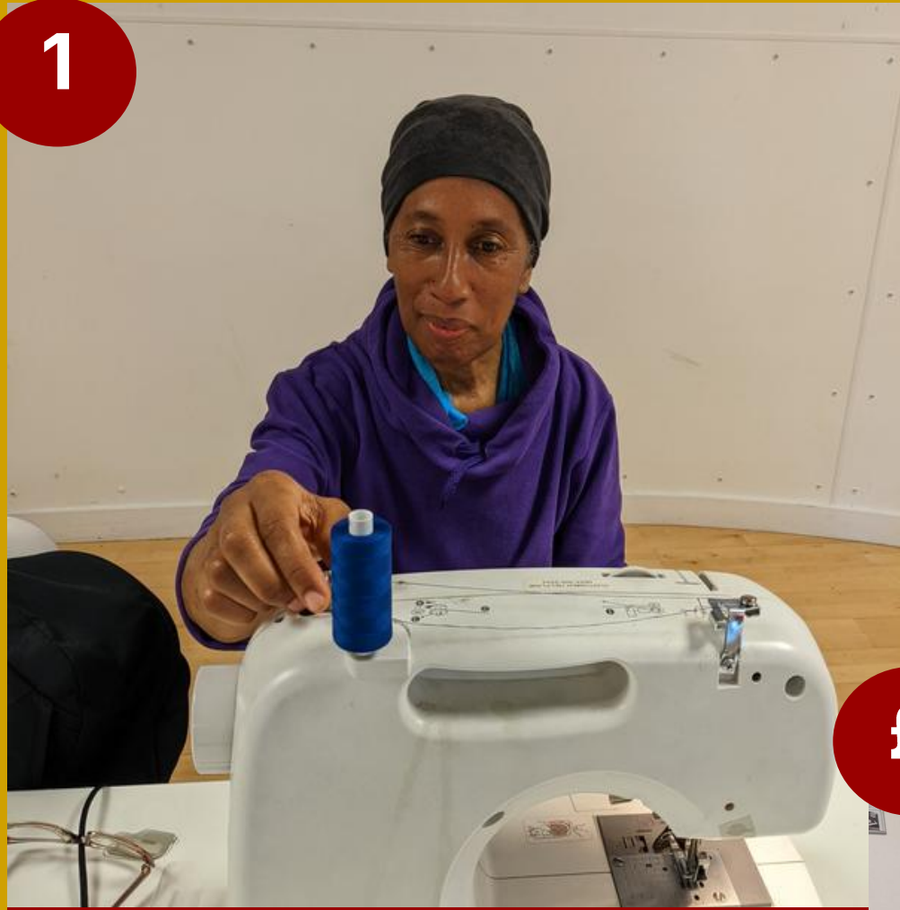
MAKE & MEND