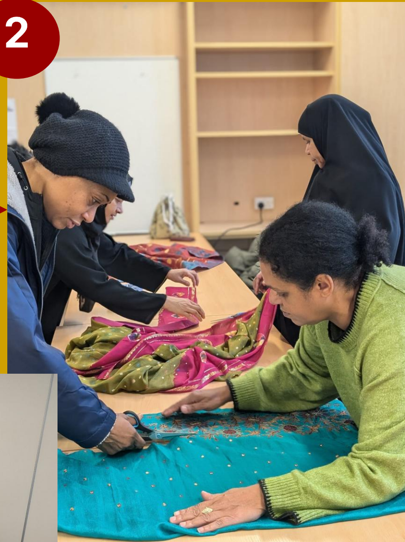
ALTERATIONS & UPCYCLE