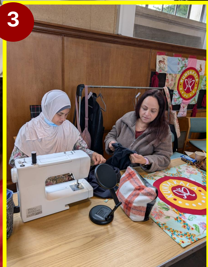
THE KUNDAKALA COLLECTIVE